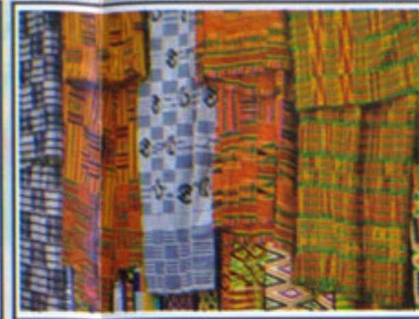
Handmade Kente Cloth and tools